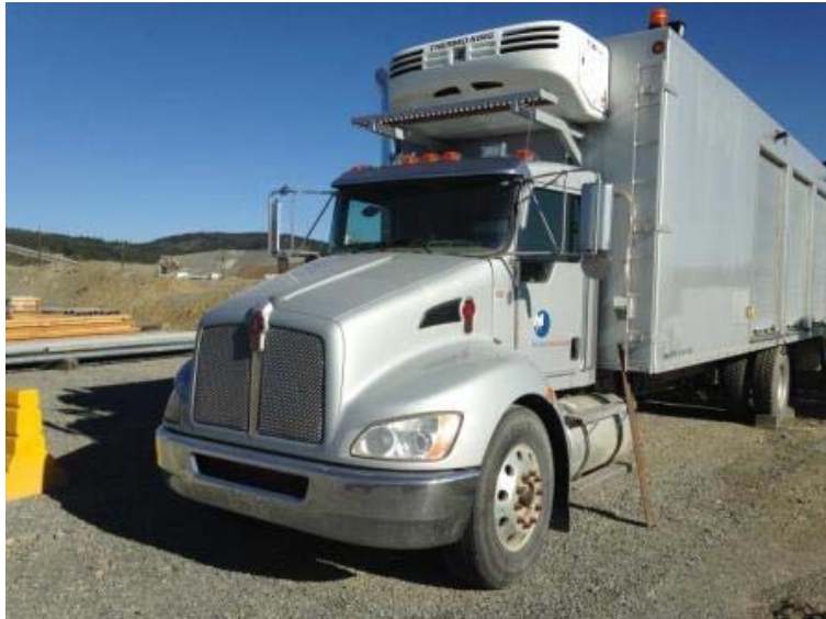
Photo showing the truck and Odometer. (note the Thermo King heater and 3 aluminum roll-up doors.)